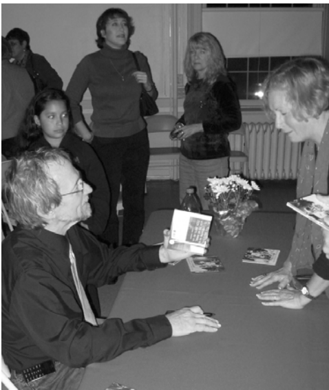
Peter Tork signs autographs for audience members at his show.

Peter Tork and his band Shoe Suede Blues drew a capacity crowd to the Joshua's Trust benefit party at Ashford's Knowlton Memorial Hall on Oct. 15.